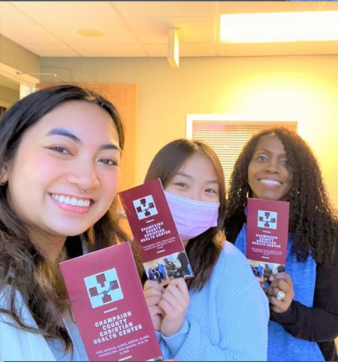
Carle prints our new brochures