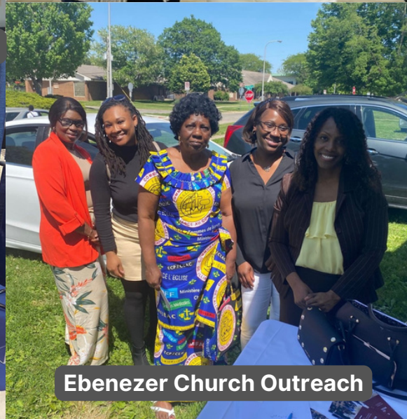
Ebenezer Church Outreach