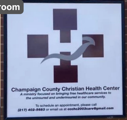
Received $118,000 in state funding from IAFC