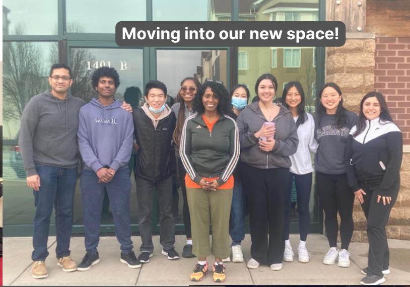
Moving into our new space!