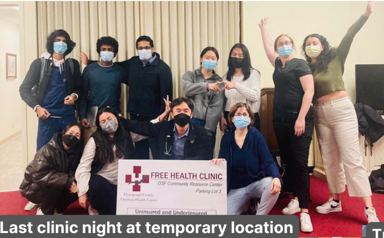
Last clinic night at temporary location