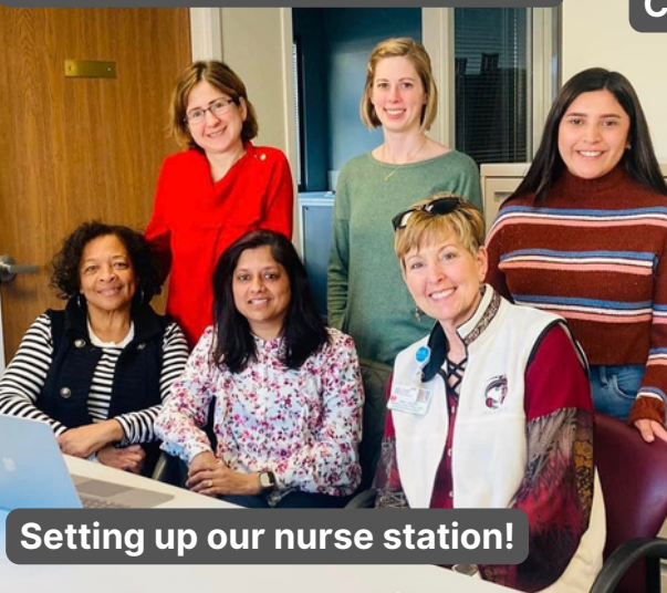
Setting up our nurse station!