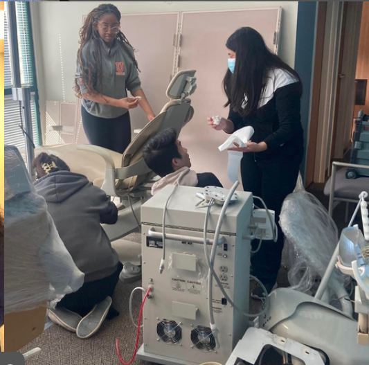
Christie Clinic 5k Outreach