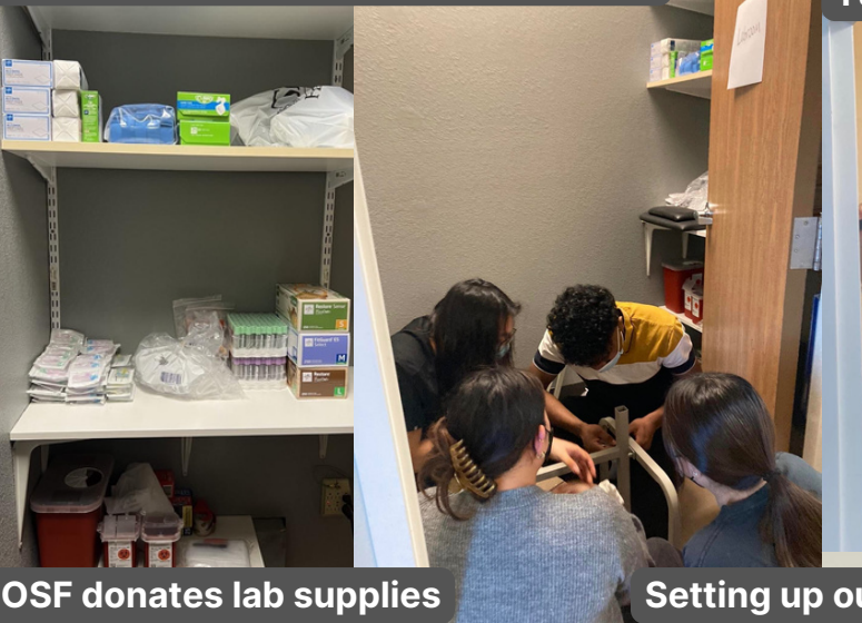
OSF donates lab supplies