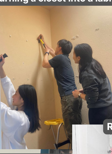
Turning a closet into a labroom